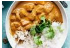
Butter Chicken & Basmati Rice $4.50