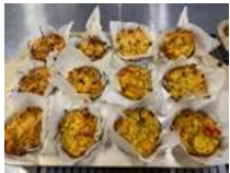
Savoury Muffins (Recess) $1.50

We have been busy this week stocking our freezers with the new Autumn/Winter menu choices. These will be great tummy warmers on these cool and rainy days!