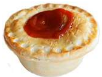
Large Good Tucker Bakery Meat Pie $4.00